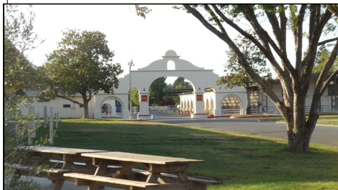
Left, Sonoma County Fairgrounds in Santa Rosa.