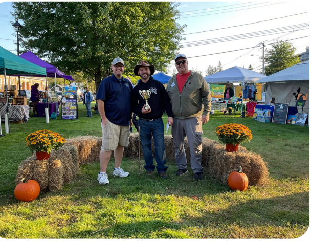
Charlton Farmers Market, early Fall 2023