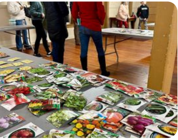
Seeds available at the Annual Seed Swap