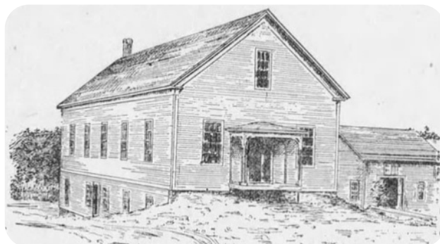
Charlton Grange as it appeared in 1897