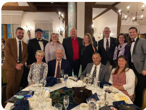
Grange members at the Mass. State Grange 150th Gala