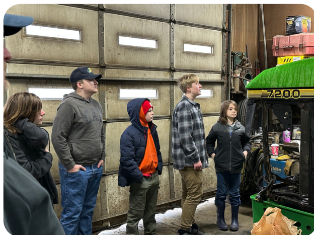
Boy Scouts learning how to change the oil on a tractor.