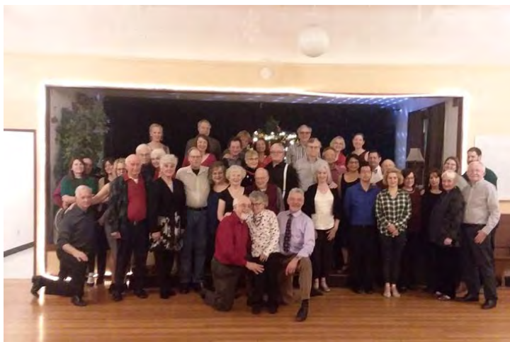
Leedy Grange December Dance Night 2019